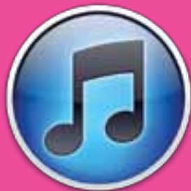
One song on iTunes